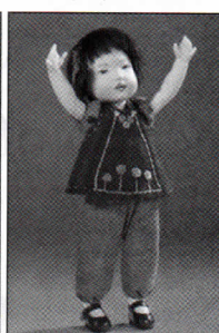
Kish & Company L.E. An-Mei $199