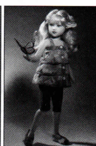
Kish & Company L.E. Piper $299