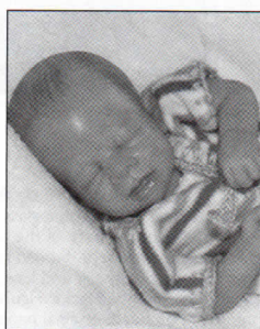
Shawna Clymer OOAK Mini Trevor $1,200